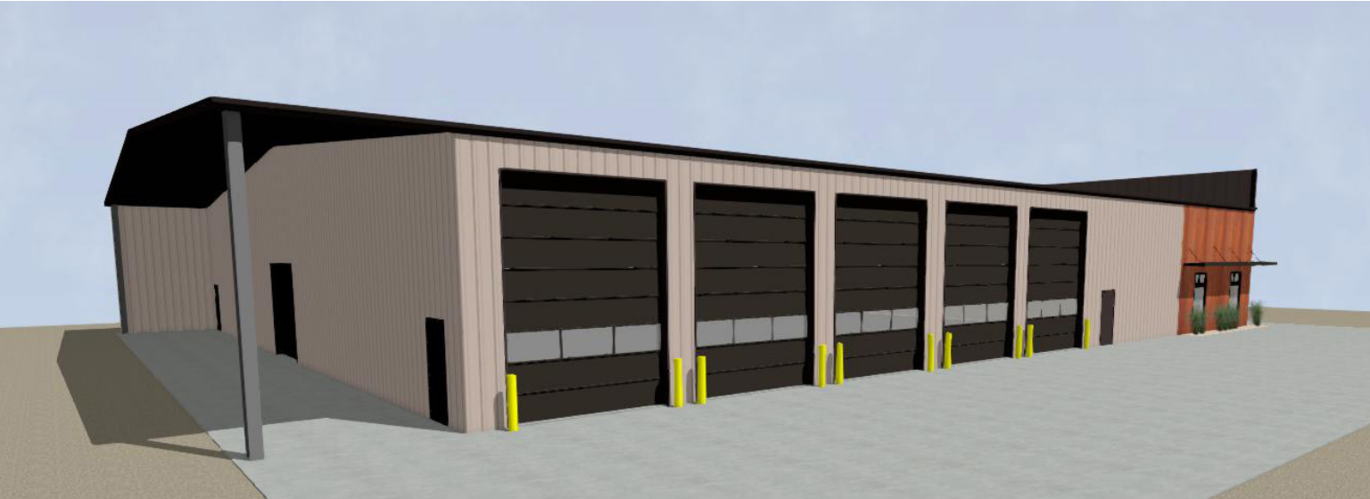
Artist's rendering of the south-facing elevation with overhead garage doors and covered material area on the west side of the new Roundup facility to be built this year.

Member Newsletter ♦ Fergus Electric Cooperative, Inc., Lewistown, MT ♦ www.ferguselectric.coop