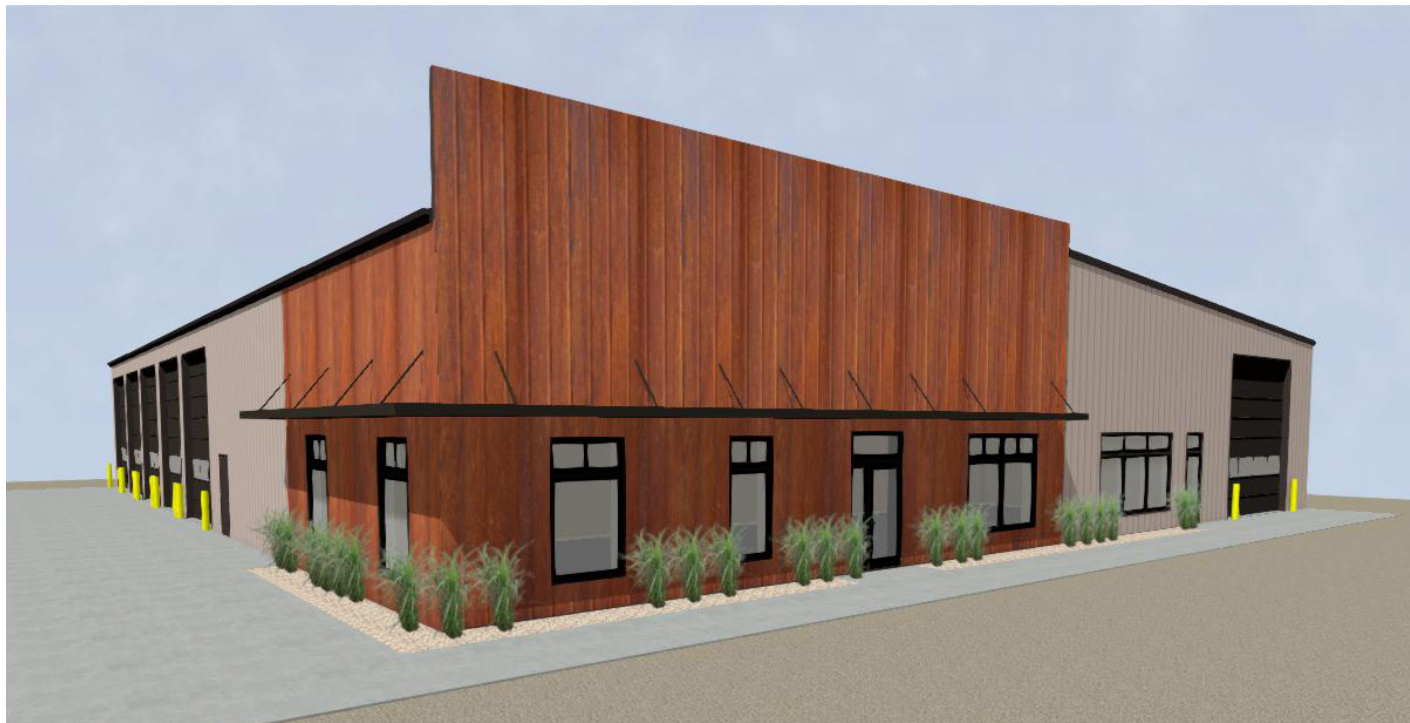
Artist's rendering of the office entrance on the east side of the new Roundup building to be built. The tan colored section is the board/community meeting room.