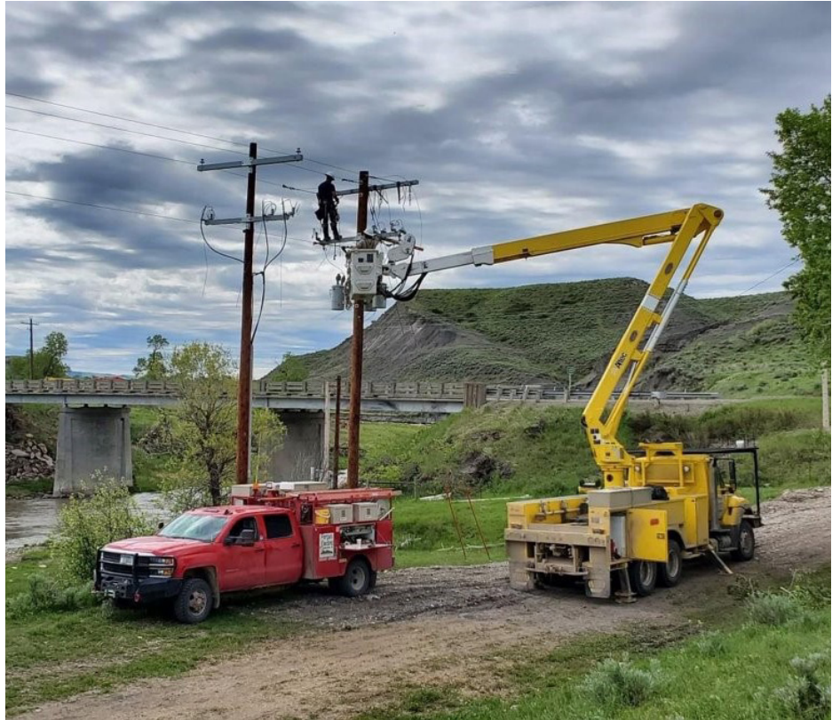
Fergus Electric Cooperative linemen are working on an irrigation service. Lineworker Appreciation Day is April 18.

to help you properly size a backup power system to meet your needs. Our Operations and Engineering staff can order the necessary equipment and help put you in touch with a local qualified electrician to complete the installation. The Fergus Electric team works relentlessly to provide reliable power 24/7/365 but power outages in rural Montana are inevitable. For members interested in a backup power source, please contact us at 406-538-3465.