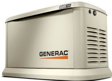
Fergus Electric Cooperative has partnered with Generac Power Systems to become a wholesale distributor of generators.

Next we are proud to announce that Fergus Electric has partnered with Generac Power Systems to become a wholesale distributor of home standby generators, industrial/commercial generators, portable generators, ecobee thermostats and other Generac products. Please contact our Engineering team to begin a discussion on your current electrical consumption details