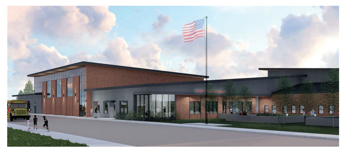
A&E Design made this 3D model of Winifred Public Schools. The project is expected to be complete by September 2022.

Member Newsletter ◆ Fergus Electric Cooperative, Inc., Lewistown, MT ◆ www.ferguselectric.coop