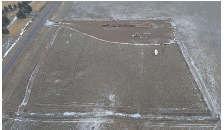
▲ EARLY MAY Drone view from west side of property.

W E are excited to see significant progress being made at the site of Fergus Electric Co-op's new building east of Roundup on Highway 12. The new facility will accommodate offices, storage for vehicles, and storage of equipment and material. KE Construction is busy working to construct the 126-foot by 100-foot metal building. Throughout this month's section, we are providing a chronological look at the progression of the construction. The plan is for construction to be completed in November. RM