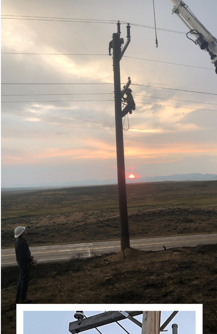
LEFT: Linemen tying conductors on a pole that was changed out.