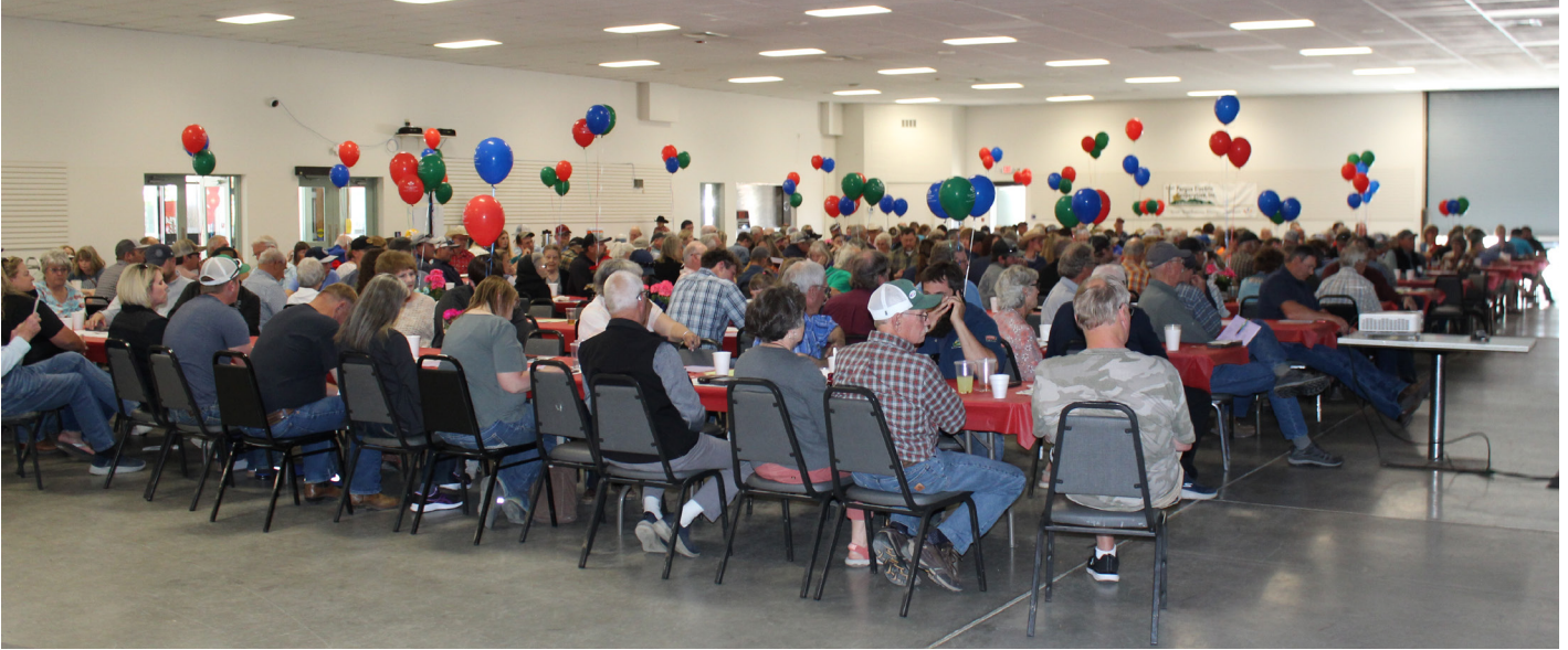
Fergus Electric's 86th Annual Meeting of the Members attracted more than 400 attendees.