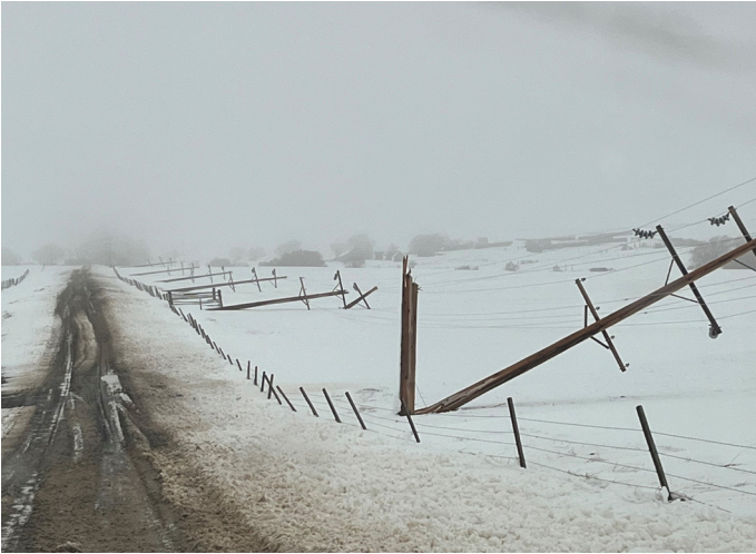
Transmission poles in the Spion Kop area were snapped all the way down the line.

Member Newsletter ♦ Fergus Electric Cooperative, Inc., Lewistown, MT ♦ www.ferguselectric.coop