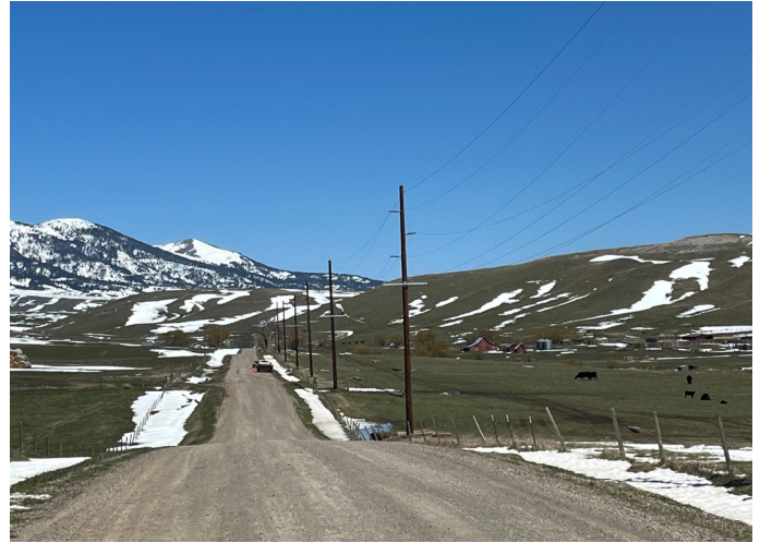
After days of hard work, the poles were replaced in the Spion Kop area and electric service was restored.