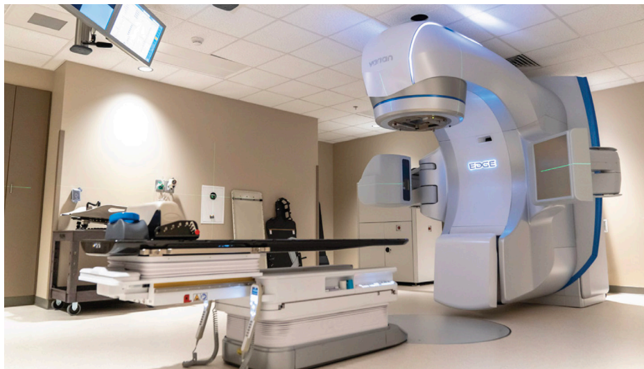
The Central Montana Medical Center received a $2,000,000 loan through the USDA Rural Economic Development Loan and Grant Program to purchase and install a linear accelerator for their new cancer center.