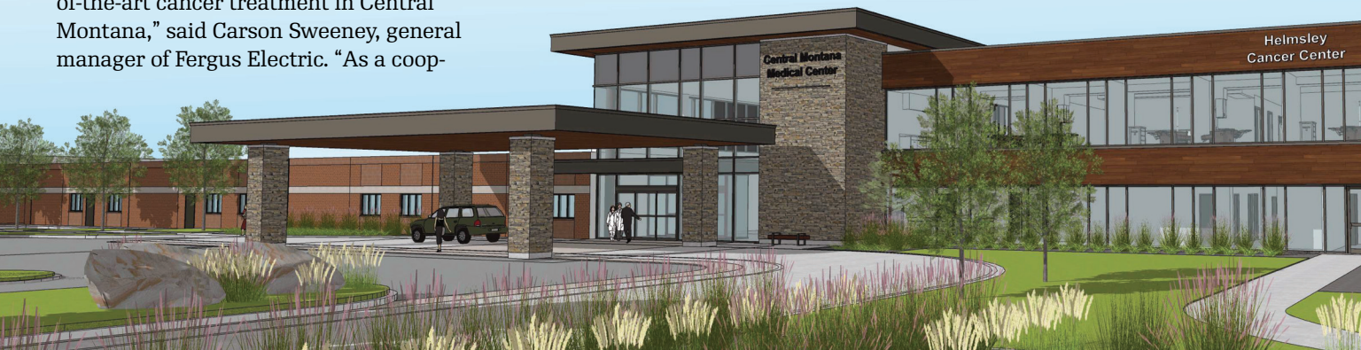
Rendering of the new Central Montana Medical Center Cancer Center