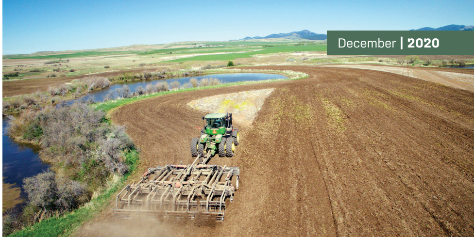
Lewistown Rental is an ag-based company. They offer a lot of modern ag equipment, which members of the community and surrounding area communities rent regularly.