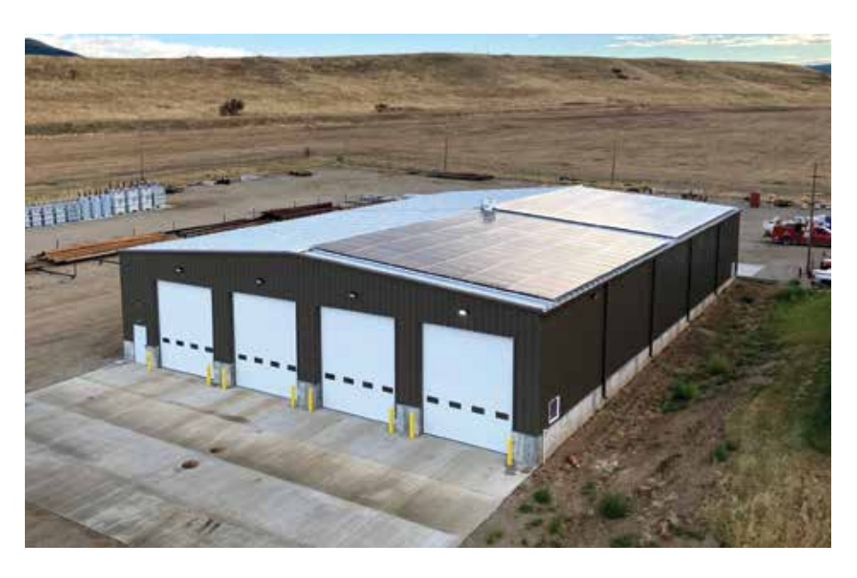
OnSite Energy completed construction on the 72kw Phase 2 roof-mounted solar array on Fergus Electric Cooperative's truck garage roof.

We are also excited to welcome Darek Dygert, journeyman line-